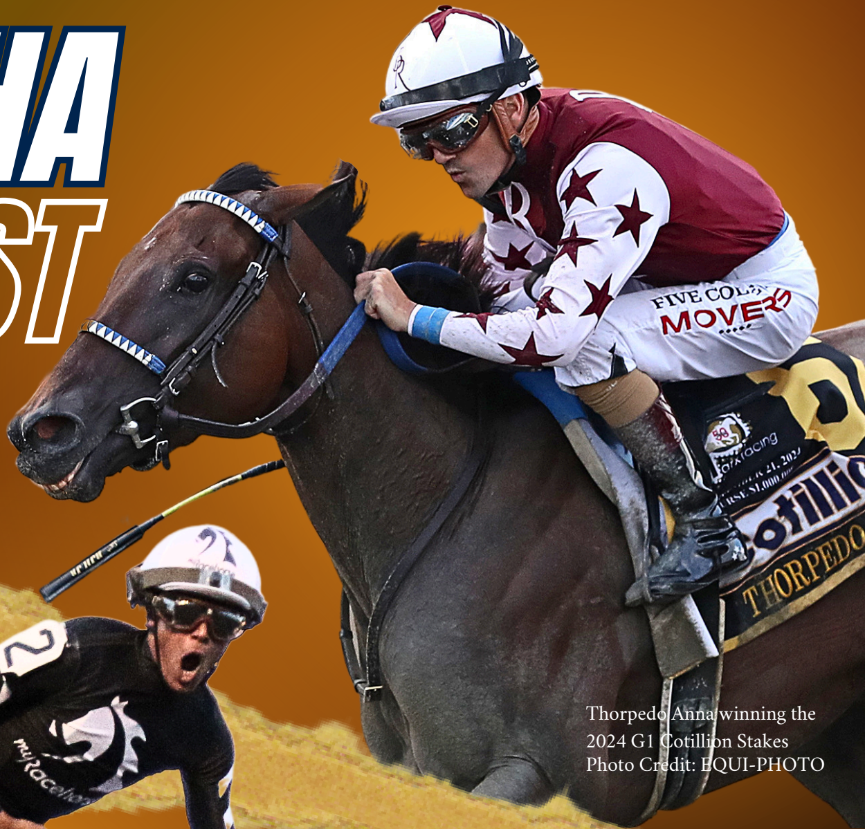
Thorpedo Anna winning the 2024 G1 Cotillion Stakes