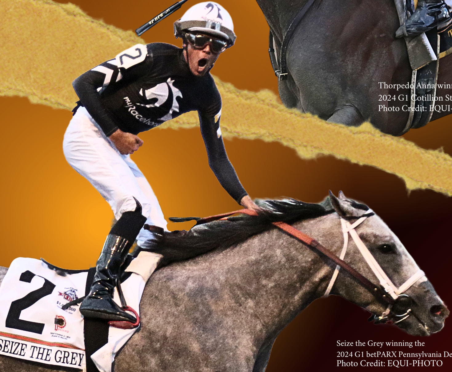
Seize the Grey winning the 2024 G1 betPARX Pennsylvania Derby