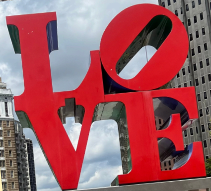
It's a Summer of Love for Smarty Jones fans all over Philly